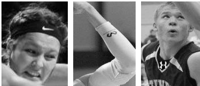
LEGAL LEGAL LEGAL

One visible manufacturer's logo is permitted on any apparel item, limited to 2¼ square inches.