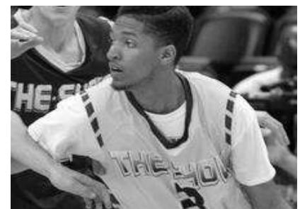
ILLEGAL - color